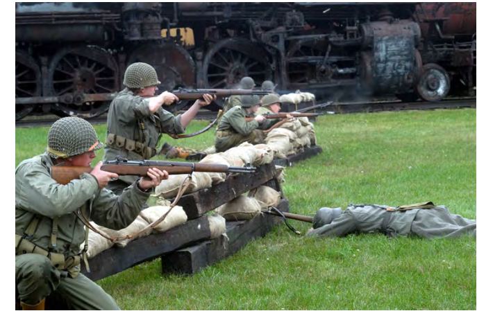
The Illinois Railway Museum held its first World War II military re-enactment on October 3, 2009. Here we see American troops storming the railroad yards in occupied Anzio, Italy.

The museum grounds, yards, and rights-of-way will become German-occupied Anzio, Italy. The Allied invading